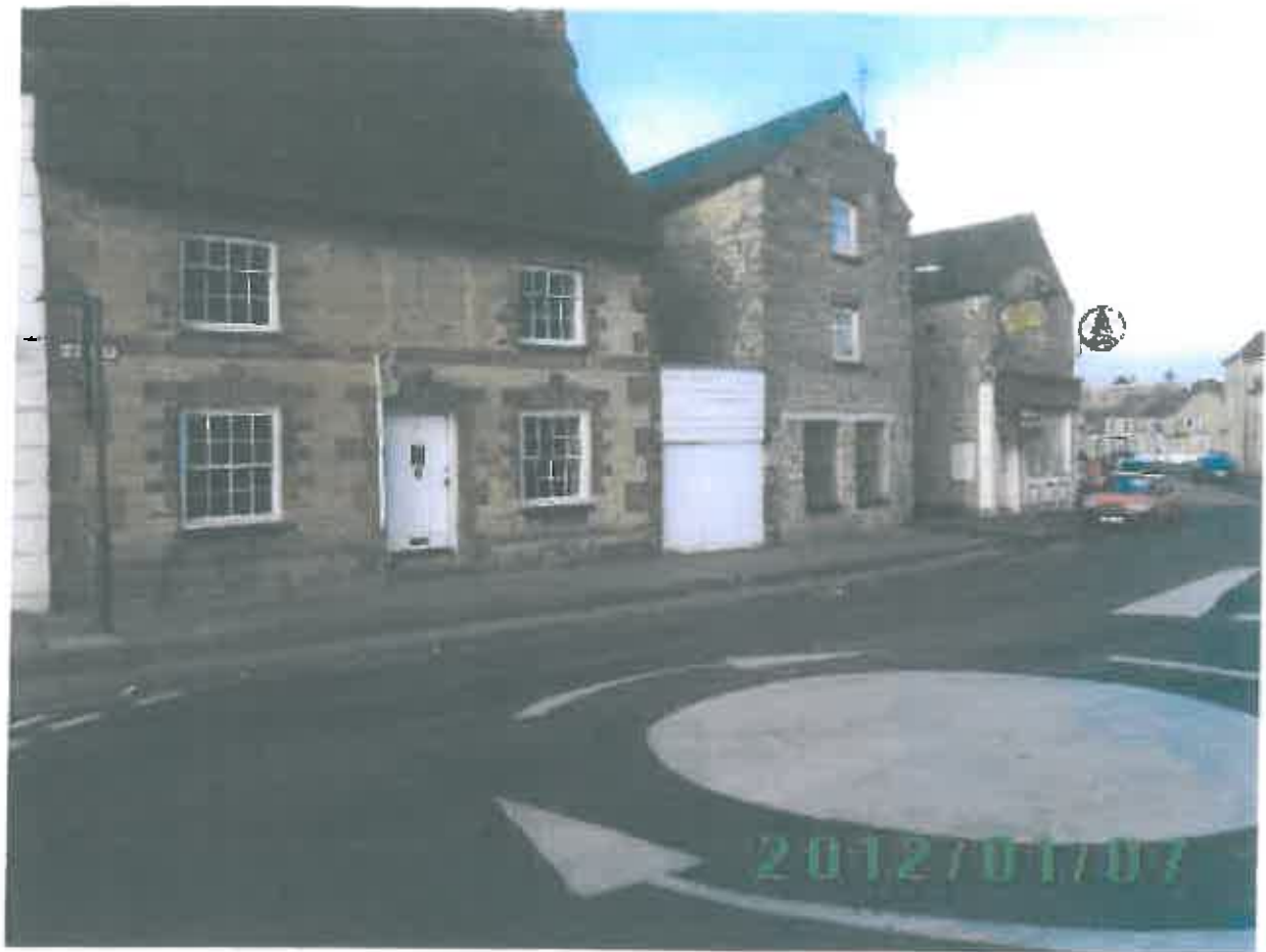
No 28 High Street Burton Latimer Showing that it is in a residential area with Houses on both sides and in front on the other side of the road