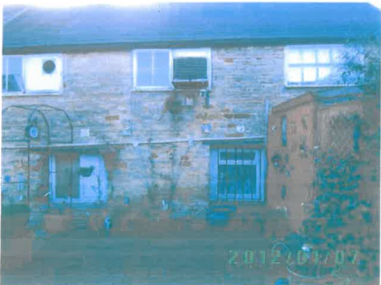
My back garden . With No 28 High Street backing onto it