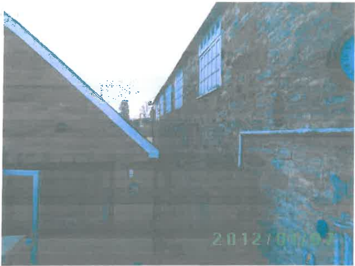
My house High Street and 28 High Street just 4 feet away*