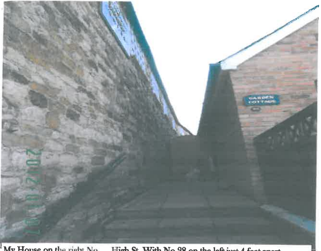
My House on the right No High St .With No 28 on the left just 4 feet apart