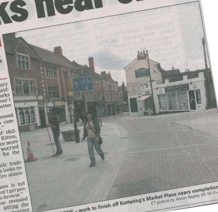
■ NEARLY DONE - work to finish off Kettering's Market Place nears completion ET picture by Alison Bagley 05-10-11-AB-5-23

The council has also revealed they are working on letting the units in the proposed restaurant quarter and is looking into a plan to use one of the units as part of the Market Square Christmas events.