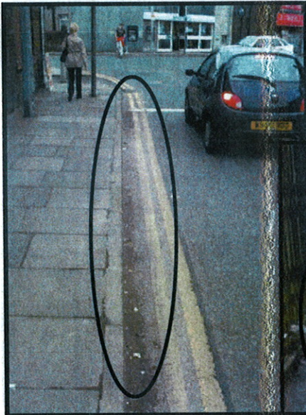
Grade C Widespread distribution of detritus, with minor accumulations