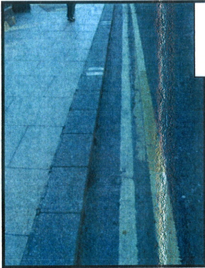
Grade A No detritus present on the transect