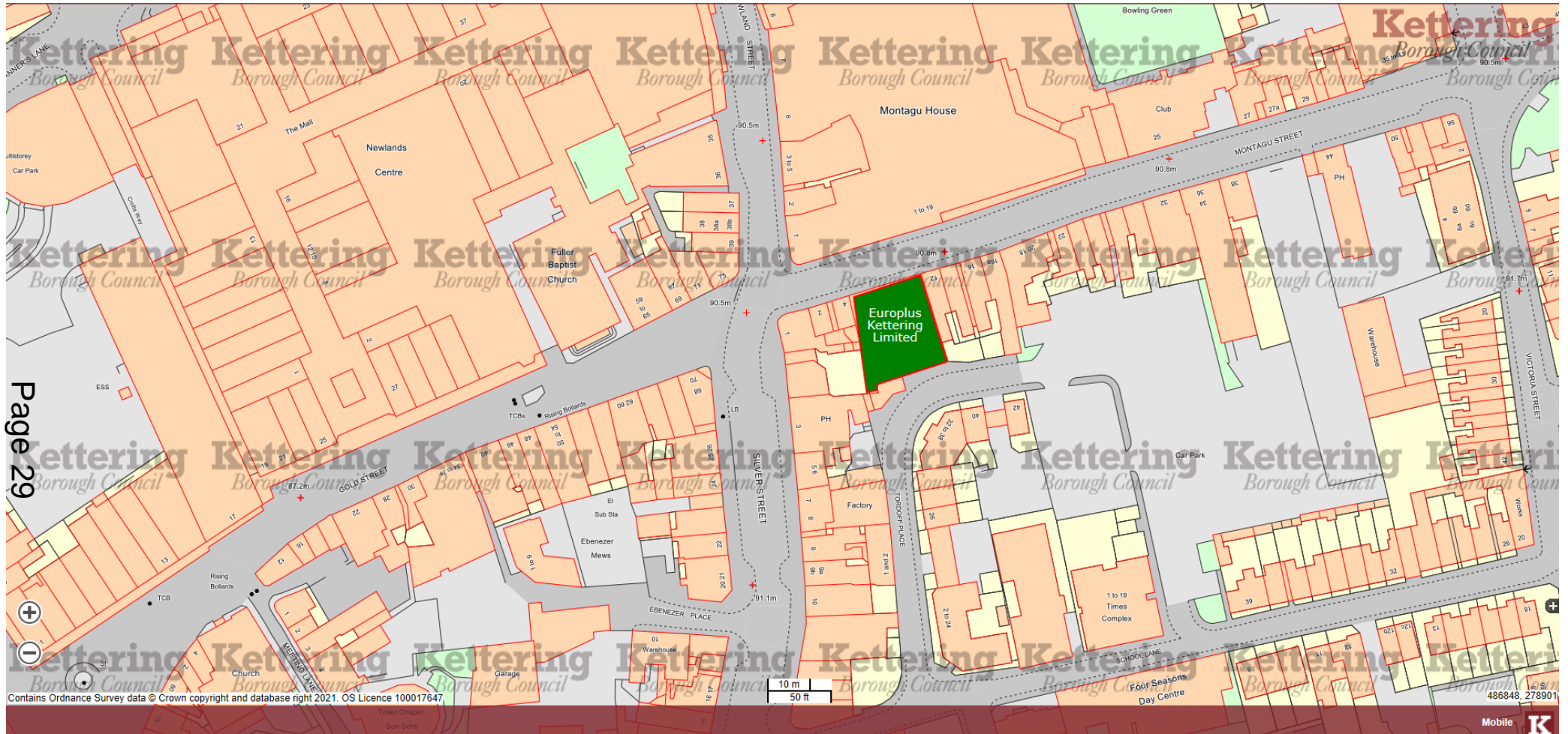
Street Plan – Europlus Kettering Limited, 6-10 Montagu Street, Kettering