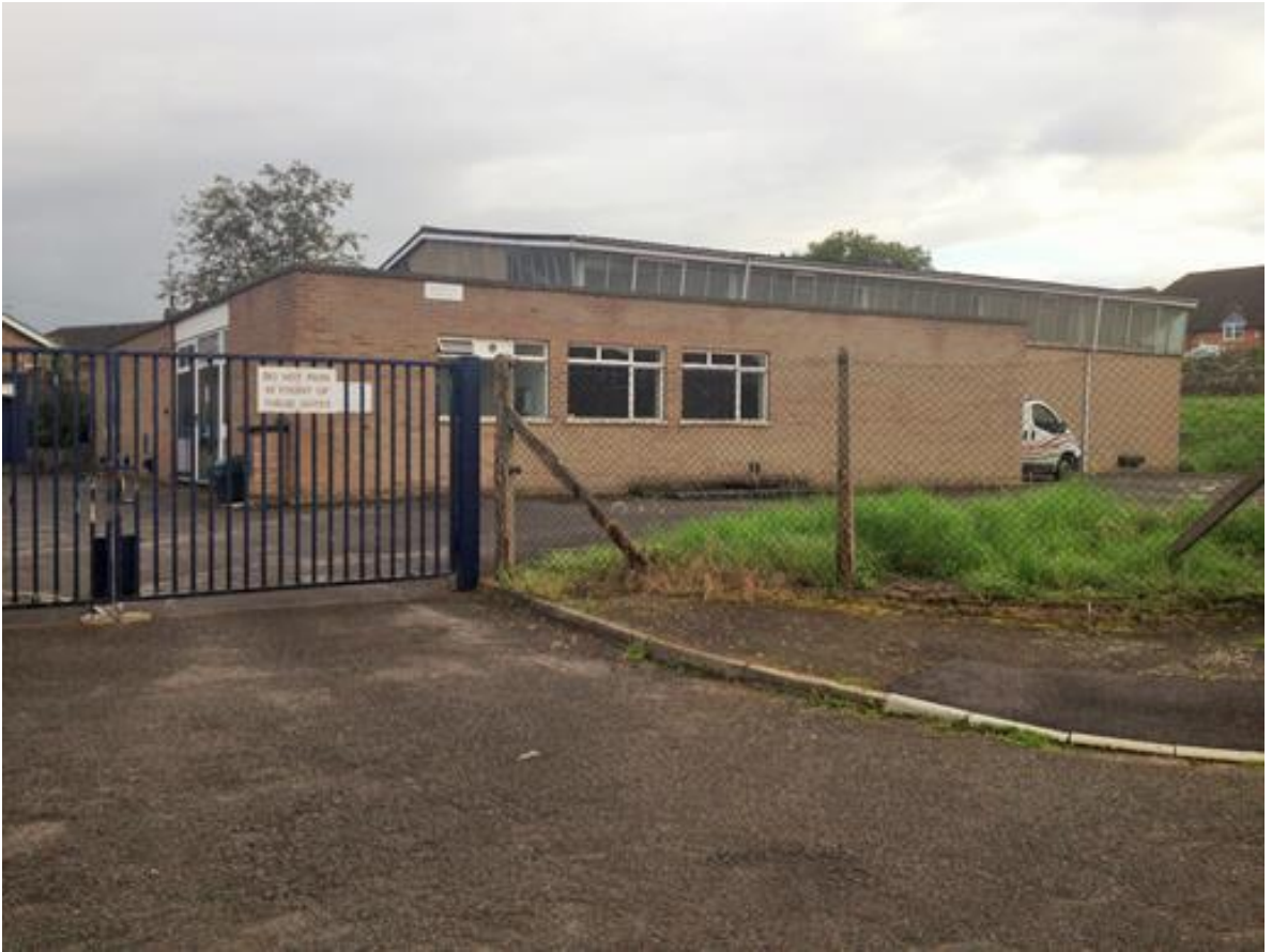
The existing BT Exchange in Church Street

The potential of the site will be a significant enhancement in Church Street