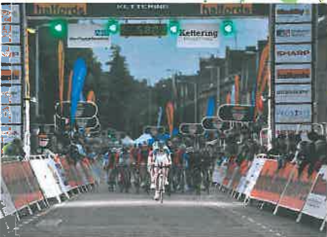
He's in the Tour Series - professionals racing in Kettering