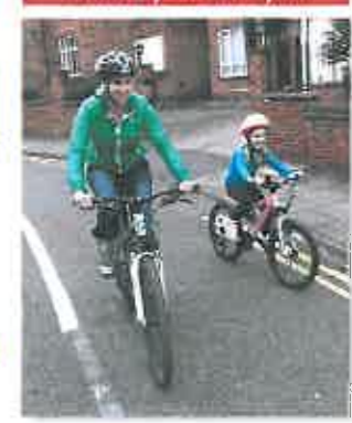
Cycling is a family matter

The key indicates the degree of skill and experience needed on the roads around Kettering. On yellow roads traffic is light and speeds are low. As you gain experience you can explore using the green and blue roads, but the pink and purple roads may be intimidating unless you are an experienced cyclist. Off-road, you may cycle on bridleways and byways. Some bridleways are only possible to cycle with all-terrain bikes, and this has been indicated in the key. The map also shows the cycle paths that have been created recently by the Borough Council and County Council working together to help more people cycle safely in Northamptonshire.