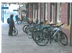
Cycle parking at Kettering Rail Station

Bright Kidz High visibility clothing, Tel 01536 526 461 www.brightkidz.co.uk