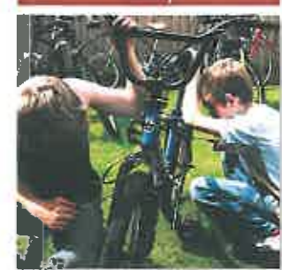
Check your bike regularly

Children especially need to take care when cycling as they are far more likely to be unaware of the dangers traffic can pose. Cyclists should be particularly alert to other traffic at junctions and near parked vehicles.