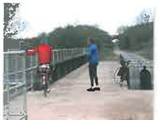
Stamwick Lakes path

Cycling for recreation is also an ideal way to interact with the environment whilst causing it no harm. There is no better way to explore our heritage of churches, nature reserves, ancient monuments, parks and tourist attractions than by bicycle.