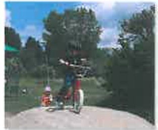
Keeping life active

Whether you are a local resident or visitor, don't forget to visit the Kettering Tourist Information Centre for more information on places to visit, things to do and local events happening within the Borough and surrounding area. See our useful contacts section for more information.