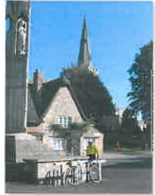
St. Andrew's Church, Geddington

One of the most attractive aspects of the Borough is its warm and welcoming environment and on this map you will find many destinations marked that you can visit conveniently by bike. For example, within 10 miles of Kettering no less than eight historic buildings can be found which rival the best in the country with their beauty and interest such as Boughton House, Rushton Hall and Triangular Lodge.