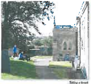
Talking of bread