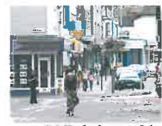
Approach Street Congestion - two-way cycle flow here

Children especially need to take care when cycling as they are far more likely to be unaware of the dangers traffic can pose. Cyclists should be particularly alert to other traffic at junctions and near parked vehicles.