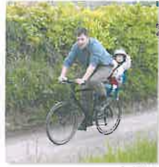
Don't 'em worry