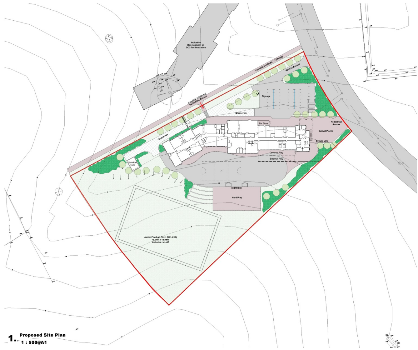
1 Proposed Site Plan 1 : 500@A1

Do not scale from this drawing for construction or acquisition purposes. Responsibility is not accepted for errors made by others in scaling from this drawing. All construction information must be taken from figured dimensions only. All dimensions and levels must be checked on site and discrepancies between drawings and specifications must be reported to GSSArchitecture. © Copyright GSSArchitecture. Ordnance Survey © Crown Copyright 2013. All rights reserved. Licence number OS15 10001306. Map Data Copyright 2013 Google.