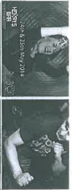
LIVE Coverage at Watercress Harry's